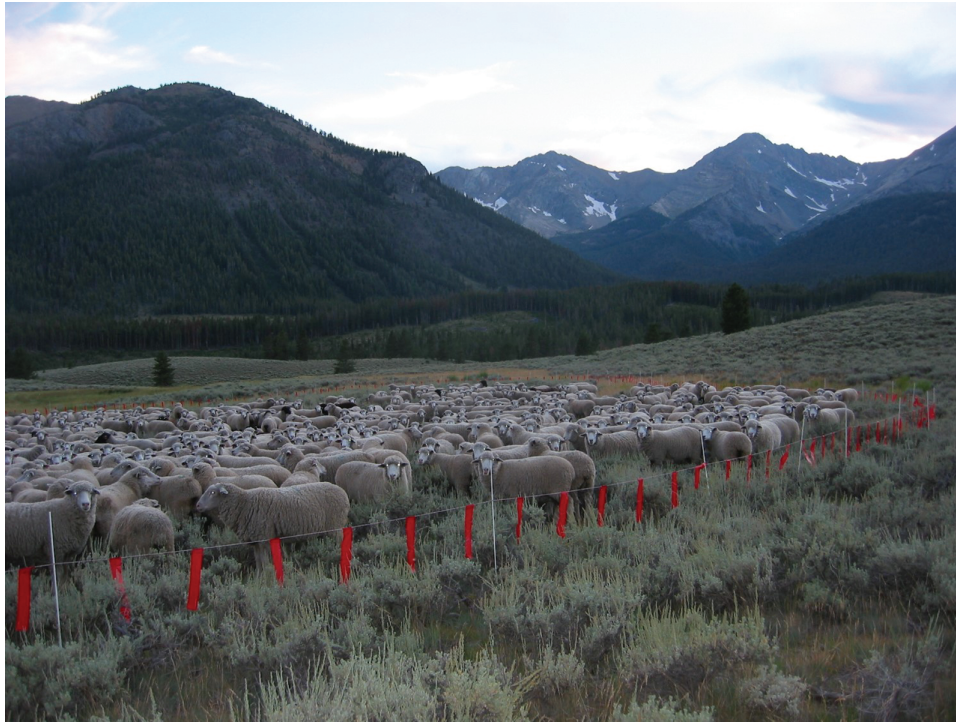
Fig. 3. —Lava Lake sheep in fladry.

There was a total of 240,000 sheep in Idaho in 2011 and, according to producer estimates, wolves killed 1,300 statewide (or 1 out of every 184 sheep statewide— United States Department of Agriculture – National Agricultural Statistics Service 2013 ). In 2012, there were 235,000 sheep in Idaho, and wolves reportedly killed an estimated 1,400 (or 1 out of every 167) sheep statewide. The National Agricultural Statistics Service reports on self-reported estimates obtained from producer surveys, which primarily represent unverified losses. However, they are the only measure beyond minimum confirmed depredations reported by state or federal agencies that provide even a rough estimate of total livestock losses. Statewide, 576 wolves were killed in response to livestock depredations from 2008 through 2014 ( United States Fish and Wildlife Service et al. 2016 ).