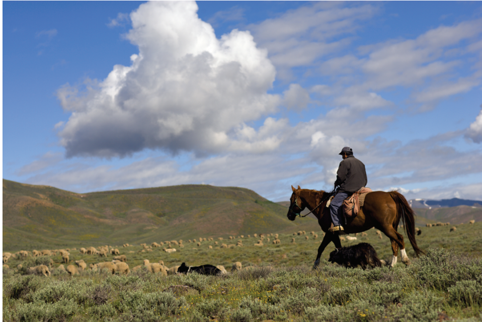
Fig. 1. —Lava Lake herder and herding dogs among the sheep.

unprotected areas, though the sheep are counted during shipping and at the end of the grazing season, which makes this scenario unlikely.